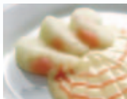
Apples and custard